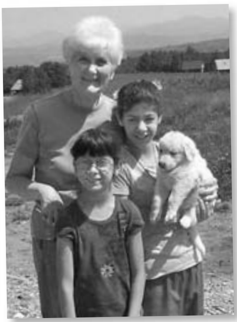
Buni/Mom with the girls on their school trip