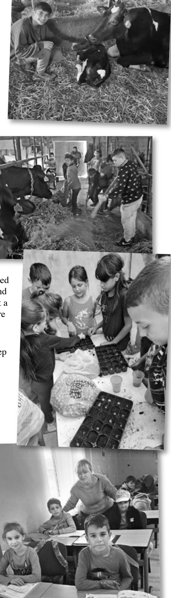
See www.hosannachildren.ca for more photos and information.