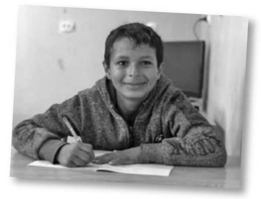
See www.hosannachildren.ca for more photos and information.